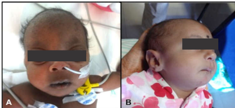
Fig. 2 (A,B): Clinical photographs of Proband case 2 and 3 respectively showing typical dysmorphic features in trisomy 18 - dolicocephaly with tall prominent forehead, small palpebral fissures, low set ears and micrognathia.